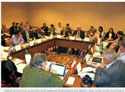
Sixteen farmers from around the world gathered Wednesday in Des Moines, Iowa, for the World Food Prize to discuss agricultural issues in their respective countries.