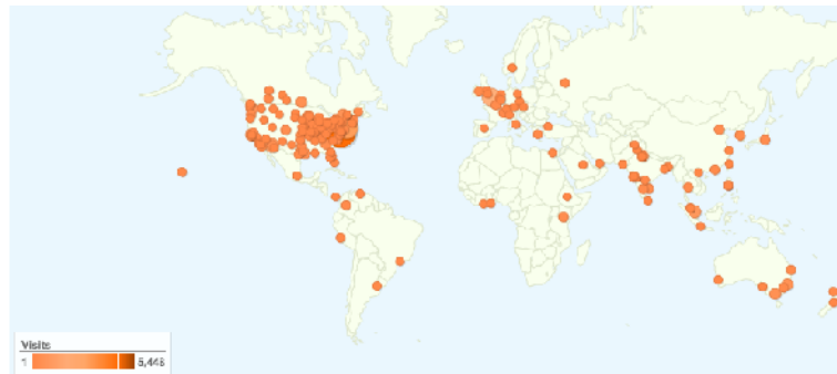
126,852 visits came from 9,080 cities