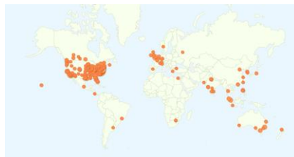
2007 TATT Website by City