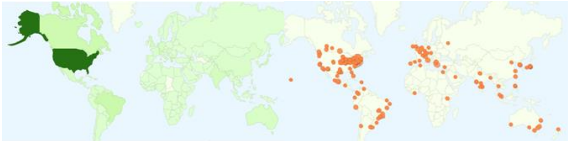
2008 TATT Website – by Country and City